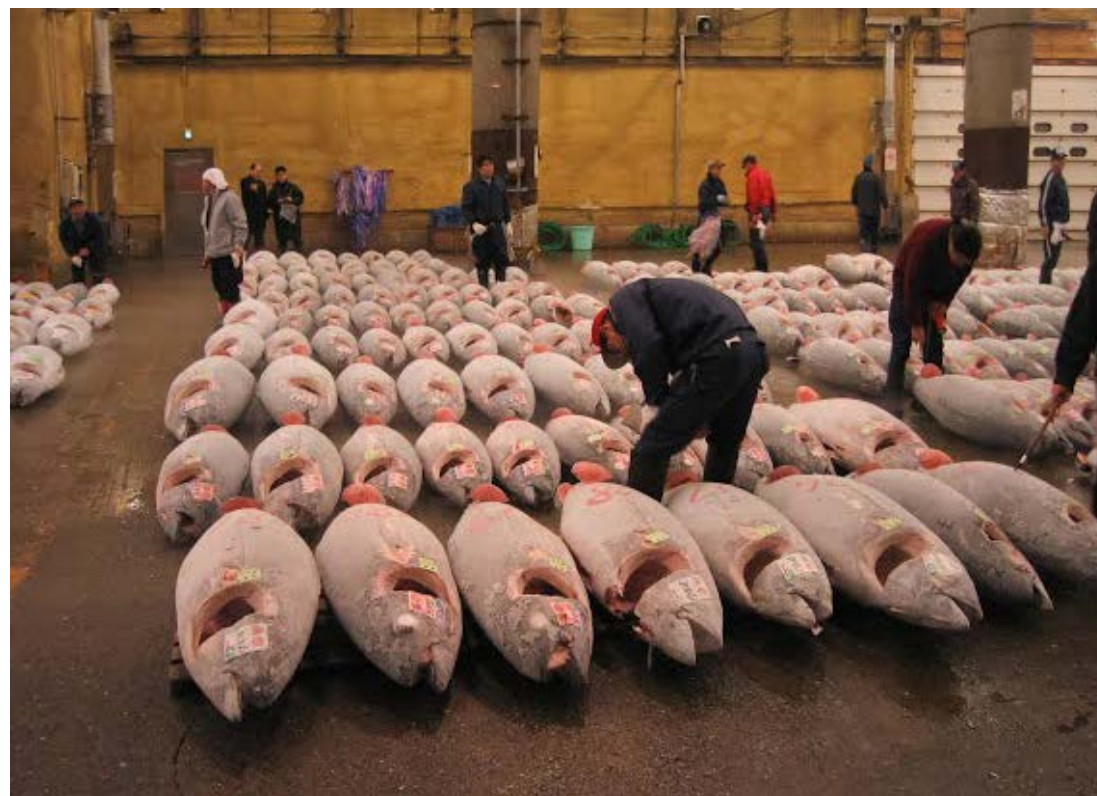
tuna at the fish market